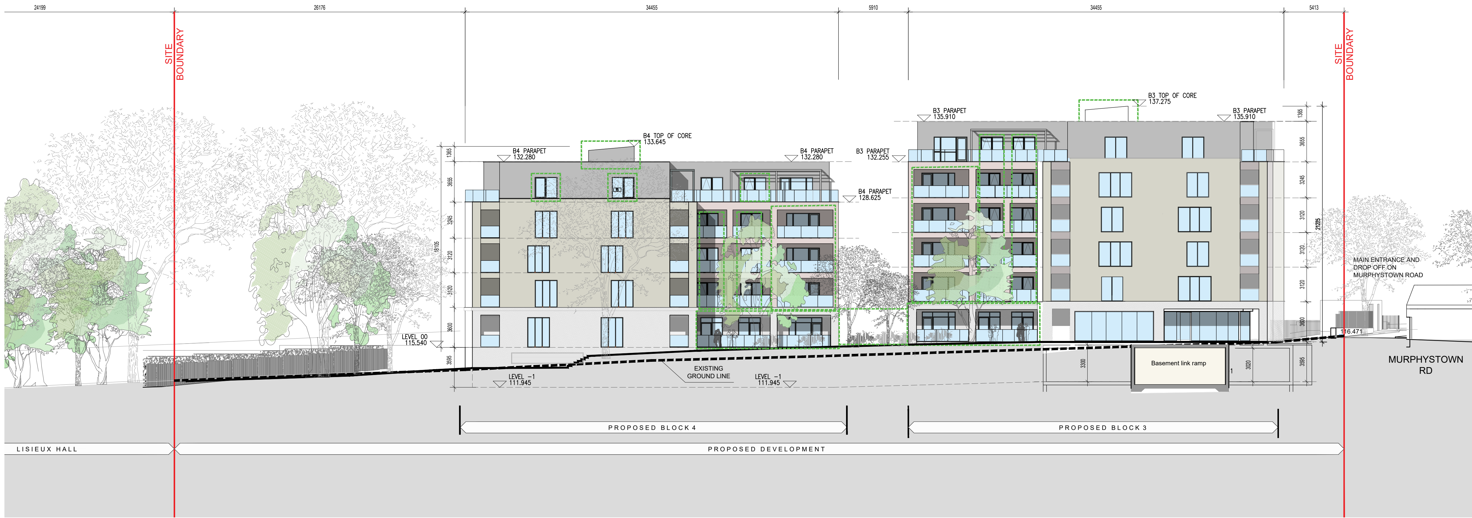
1 2008 1:200 PROPOSED EAST PODIUM ELEVATION (BLOCKS 3&4)

NOTE: NO PERMITTED ELEVATION SHOWN AS THERE WAS NONE SUBMITTED IN PREVIOUSLY PERMITTED SCHEME (REG REF.ABP-307415-20)