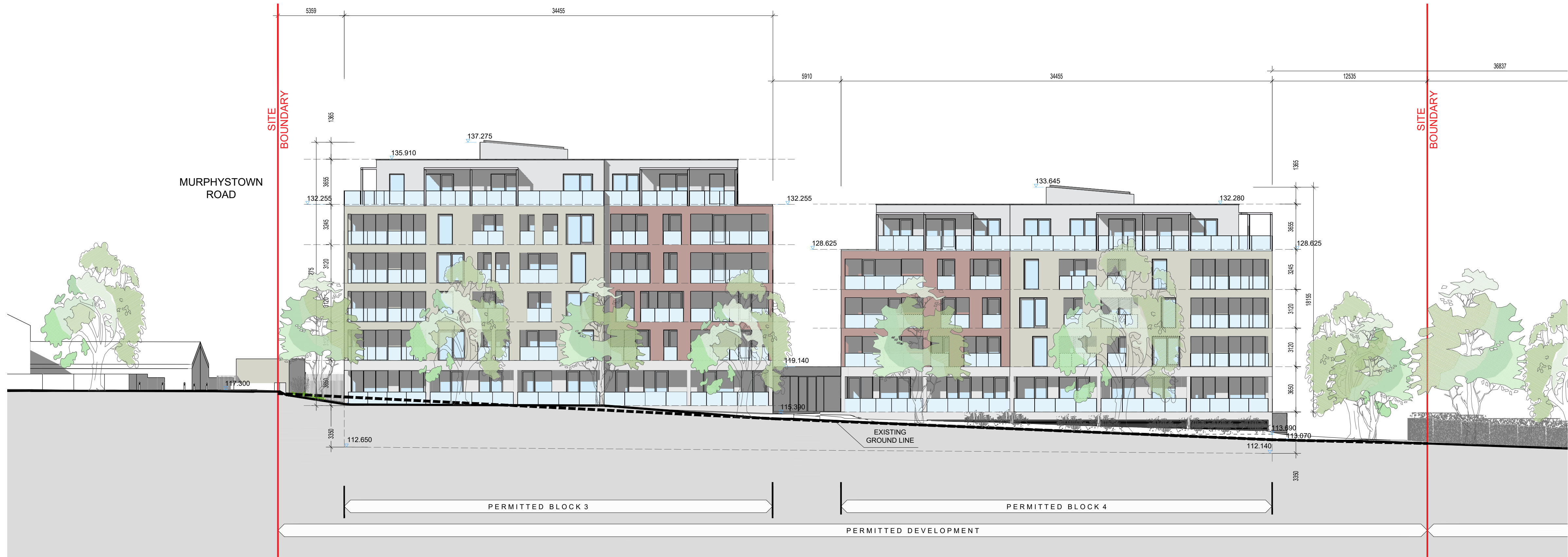
1 2002 1:200 PERMITTED WEST ELEVATION (BLOCKS 3&4)