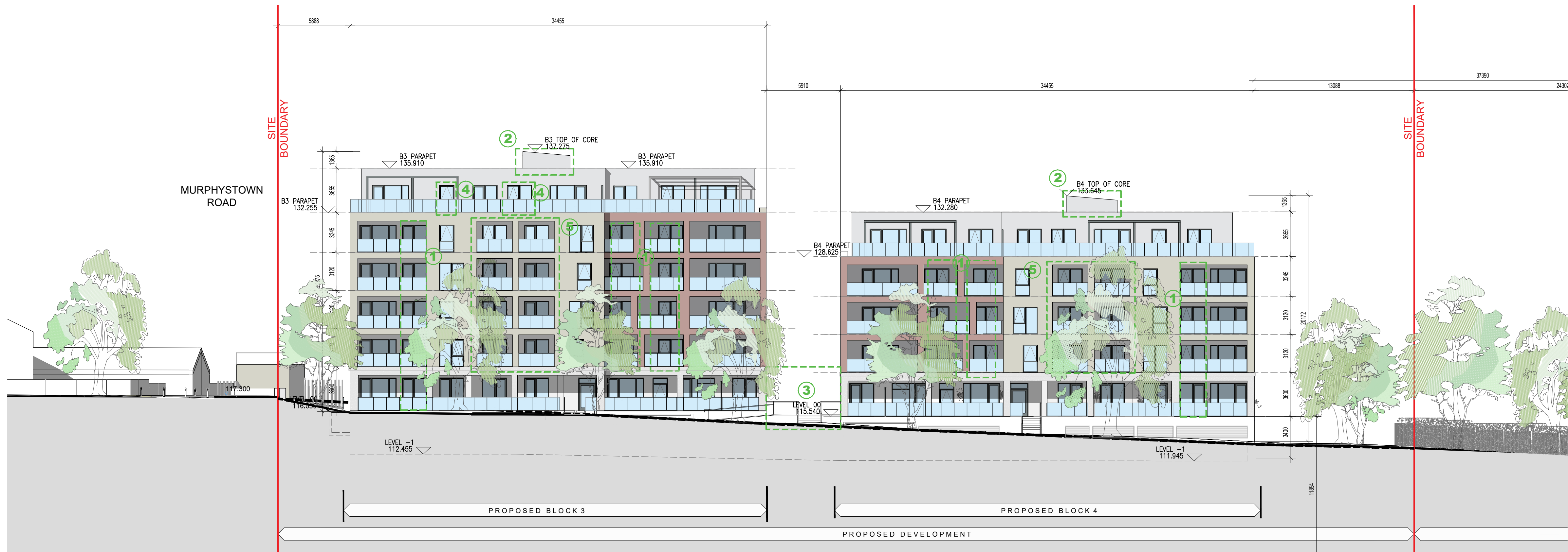
2 2002 1:200 PROPOSED WEST ELEVATION (BLOCKS 3&4)