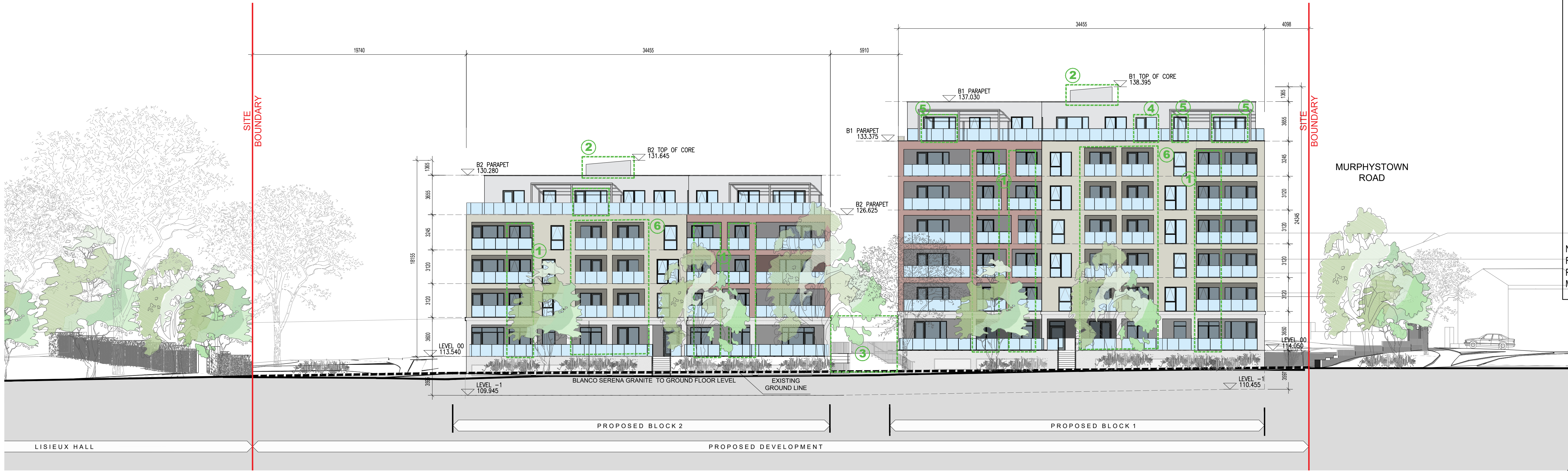
1 2001 PERMITTED EAST ELEVATION (BLOCKS 1&2) 1:200